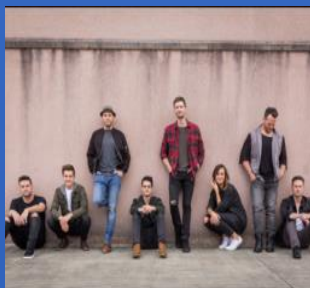
Worship Northpoint Inside Out